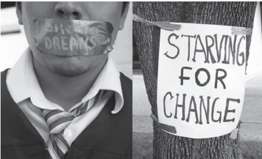
5 Day Fast, 2010, diptych archival inkjet prints, 24" x 20"

Influenced by the possibility of such legislation, Murillo Tinnen combines her activist instinct with her skill of documentary photography in a recent series called American DREAM . The subject of these photographic portraits are students who are either already in college but have no hope to continue their advanced education or have graduated but cannot pursue employment. The barrier that stands between them and a successful future in the United States is their immigration status. These are the children of