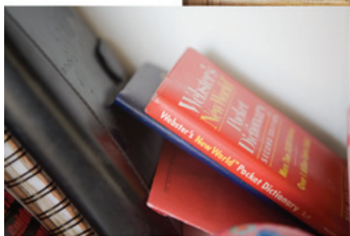
age 3, Marketing