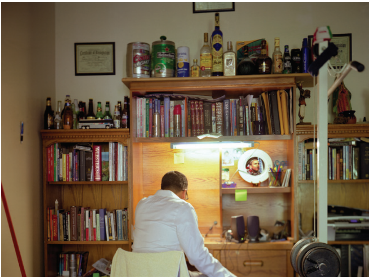
Political Science, Age 7, 2009, giclée print, 30" x 40"