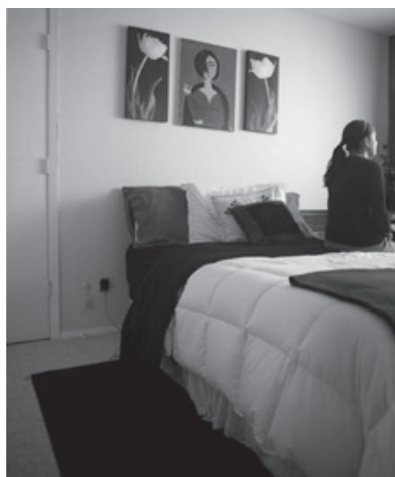
Radio, Television, Film, Age 7, 2010, archival inkjet print, 24" x 20"

Murillo Tinnen incorporates visual elements of national identity through photographic composition and in the American DREAM series, she overlays historical maps to depict locations most of these students have only seen in books. In addition, she adds texts from interviews to provide a more intimate portrayal of the person depicted. In Music/ASL, age 3 , from 2009, Murillo Tinnen captures the struggle of one young man to simultaneously embrace the culture in which he was raised while wanting to retain a connection through language to Brazil, a familial culture that he barely knows.