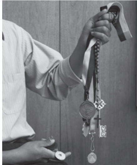
Mechanical Engineering with Medals, Age 2, 2010, archival inkjet print, 24" x 20"