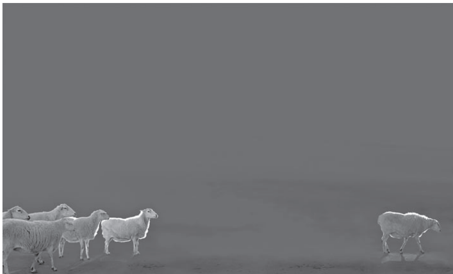
Untitled 14 , 2007, Digital c-print. 50" x 30".

Hunter's exhibition at Women & Their Work plays out these acts of capturing and their reversal, a process that allows, demands really, that the viewer act out – or try on – various subject positions. The exhibition begins with a series of smaller, 20-inch square images of water animals, such as sharks and insects such as butterflies. Owing to their habitats,