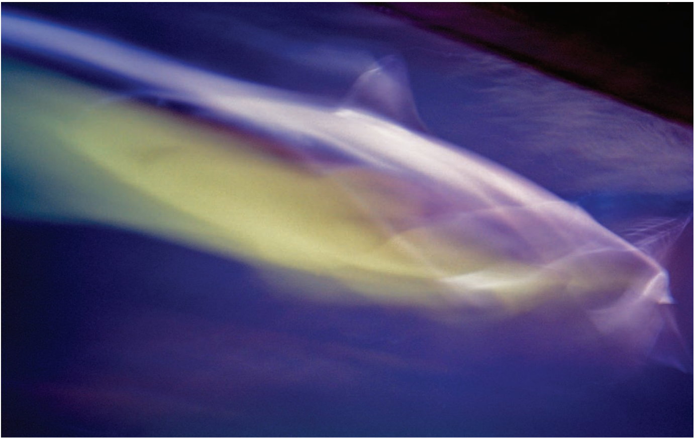
Untitled (shark) , 2008. Digital c-print, laminated and mounted, ed. of 5. 50" x 30".