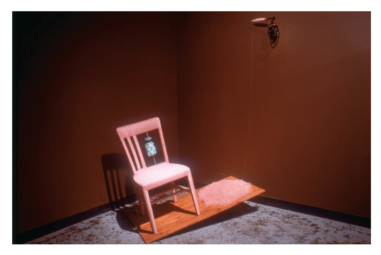
Weight. 2004, Installation and Type C print