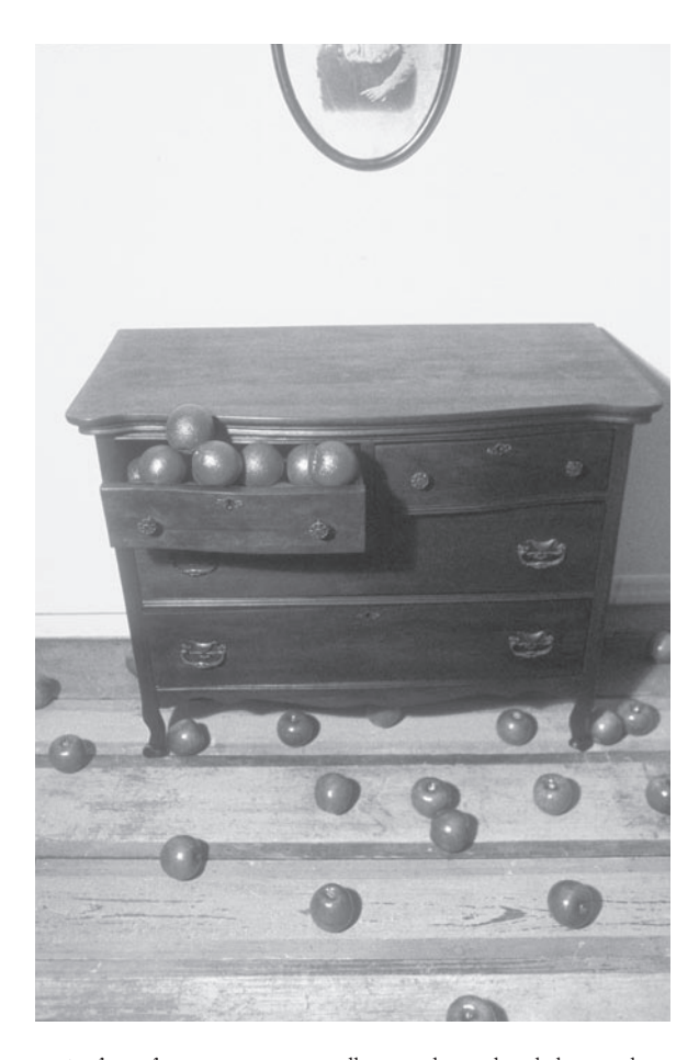
Apples and Oranges. 2004, Installation with sound, and photograph

In all her work. Sotak seeks to influence the viewer's experience by employing what she describes as "controlled viewing." Her early work consisted of monumental photo-graphic murals with images partially obscured by expressionistic paint strokes. She mediated portraits of herself alone as a child, and with members of her family, with color and gesture, adding emotional and psychological content to what had become for her a sterile medium. "Black and white photography didn't convey enough emotion. I wanted to change the documentary element of these pictures by adding an additional surface for the viewer to decode." Ultimately these works migrated off the wall into three-dimensional installations combining photographs, utilitarian objects and natural materials such as sod or jelly donuts. Access to the visual information in the installation — sometimes in the form of a performance - was always controlled; viewpoints were orchestrated or enforced through peep holes, curtains, or video monitors—devices that forced "three dimensional reality to be viewed from a single access point, much in