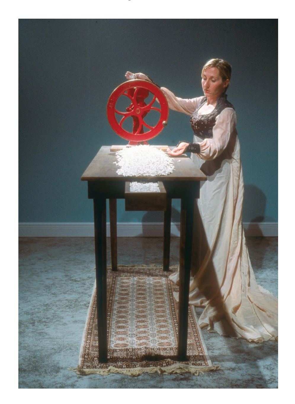
WOMEN & THEIR WORK