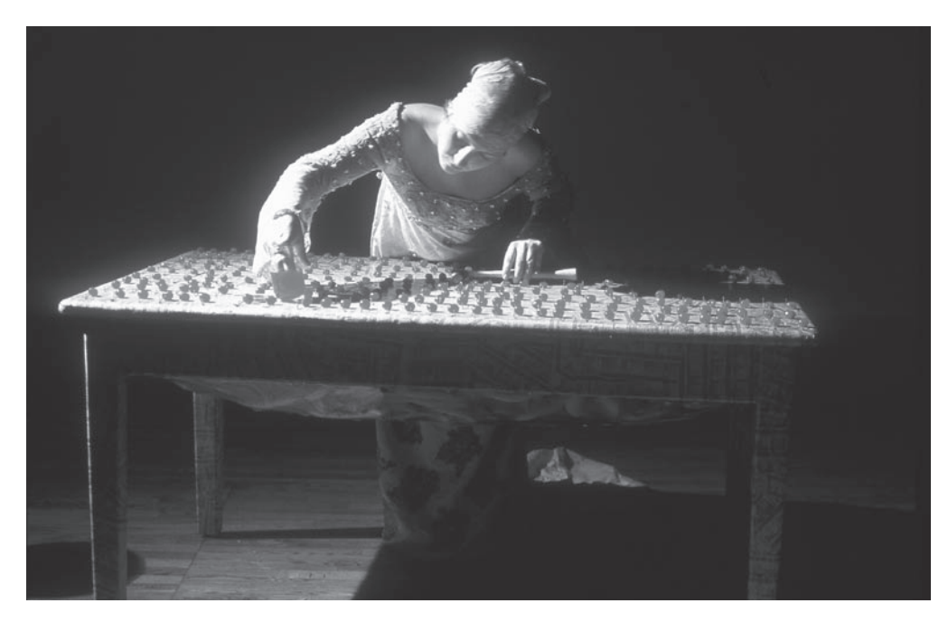
CALL ME FOR DINNER, sometime. 1999, Installation and Performance, and Type C print

preoccupied with daily routine and repetitive cycles of behavior. Each day, we engage in what I think of as the absurdity of static repetition, and we are not always sure what we are trying to achieve." In this new body of work she has pushed the boundaries of her craft, seeking new metaphors for our human routines.