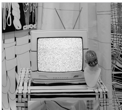
The Corner Room , 2017-2018, (detail), pen, ink, acrylic, marker, fabric, paper, and drawings on collected objects, dimensions variable