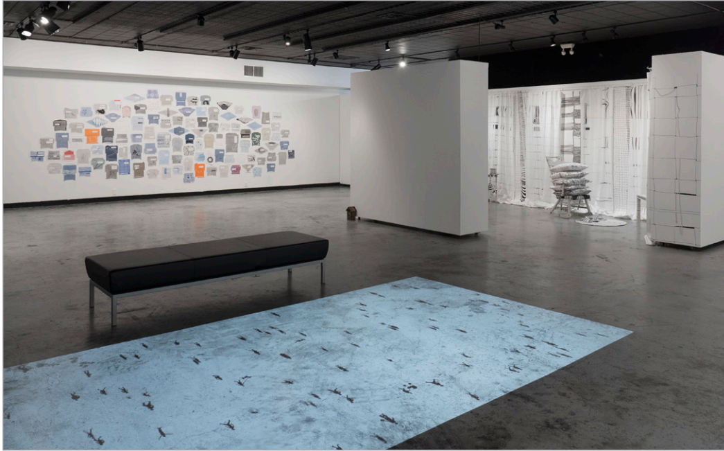
If I could, I would cover everything with my drawings , 2019, (gallery view), pen, ink, acrylic, marker, fabric, paper, mixed media drawings, and interactive animated drawings