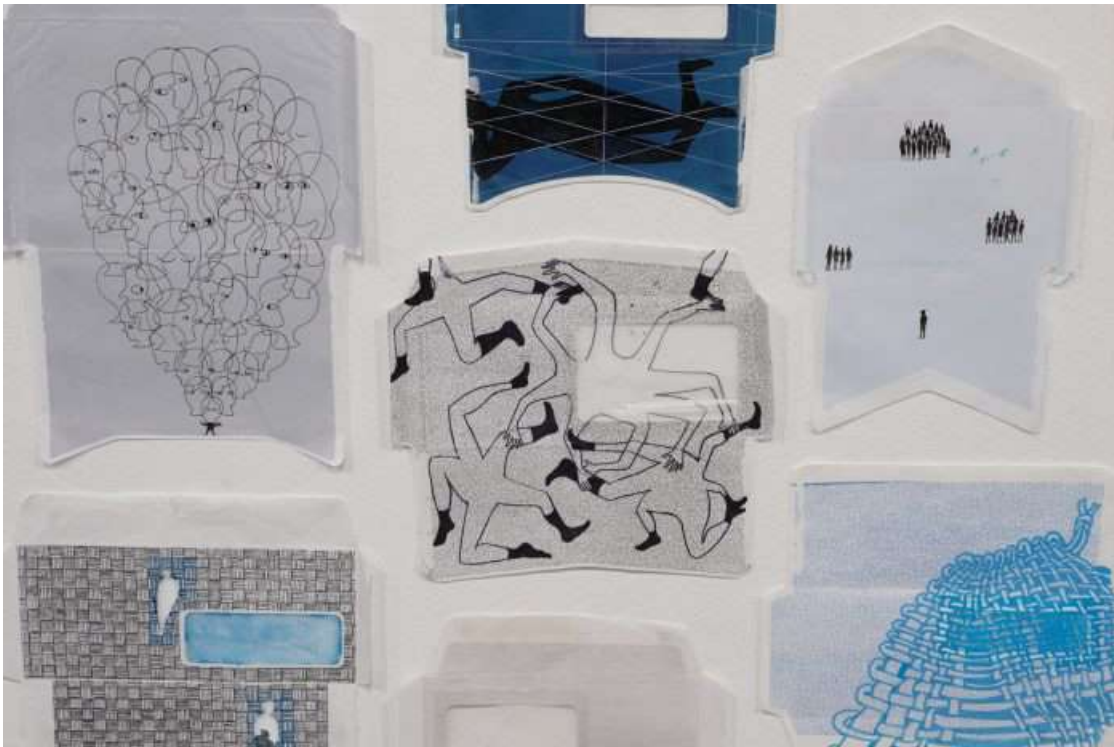
Hedwig Jacobs, installation view of "Inside of Envelopes," at Women & Their Work.

The envelope project in particular is beautifully intimate — a glimpse into the artist’s private, personal collection — while offering a window into Jacobs’ fascination with form. The patterns and colors on envelope interiors often go unnoticed (or go directly into the recycling bin), but here their patterning scaffolds Jacobs’ figures, determining their postures and attitudes, providing barriers and bridges for their bodies, and a welcome relief from the “Tiny Drawings” mise-en-scènelessness.