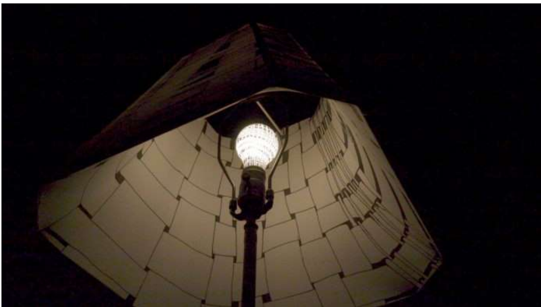
A painted lightbulb and shade, part of Hedwige Jacobs' installation "The Corner Room," at Women & Their Work.

"If I could, I would," these blanknesses seem to say, "but I can't." The show's moments of incompleteness, though, don't feel like an act of surrender. It's the necessary and vibrant incompleteness of a project in progress, a life that is still being lived.