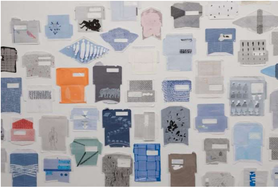
Hedwig Jacobs, installation view of "Inside of Envelopes," at Women & Their Work.

The envelope project in particular is beautifully intimate — a glimpse into the artist’s private, personal collection — while offering a window into Jacobs’ fascination with form. The patterns and colors on envelope interiors often go unnoticed (or go directly into the recycling bin), but here their patterning scaffolds Jacobs’ figures, determining their postures and attitudes, providing barriers and bridges for their bodies, and a welcome relief from the “Tiny Drawings” mise-en-scènelessness.