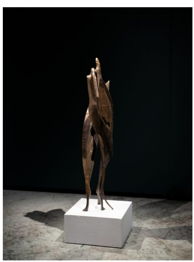
Shana Hoehn, Moth emerges from Lady-jet cocoon, 2019, bronze, 10" x 48" x 10"

Jutting nearly four feet out from a verdant wall is the revengeful bronze and steel 400 years of digestion, serpent swallows ship (2019), wherein a bloated, coppery-brown snake floats, eyeballing a metallic breast-as-wall-mount. Only mild oxidation shows on the russet epidermal surfaces, though a milky-green film of corrosion, or even a thin skin of algae, would not appear out of place. The serpent has recently gorged itself on a sailing vessel, one modeled after a Plymouth brand hood ornament, which is itself modeled after the Mayflower ship that carried the Pilgrims to colonize America 399 years ago. More specifically, the "400 years" in the title may also reference the exact length of time that has passed since the advent of slavery in what is now the United States. Amplified and distended to a disconcerting degree, the reptile's silhouette resembles the Xenomorph's skull from the original Alien , a film where the bodies ofhe archetypal colonizers get colonized.