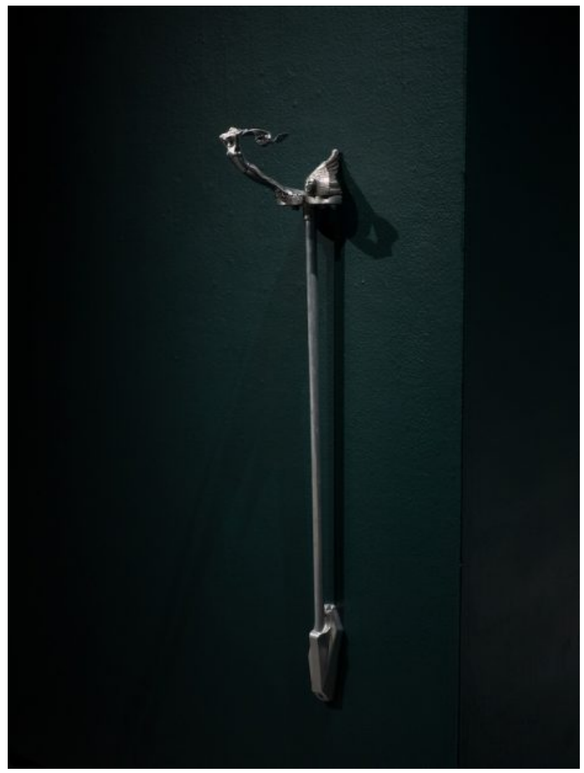
Shana Hoehn, Duplicates of Cadillac Goddess and Pontiac Chief hood ornaments, 2019, aluminum, steel, 5" x 40" 8.5"

What is startling to contemplate, however, is how utterly invariant the aesthetics of subjugation have remained over hundreds of years.