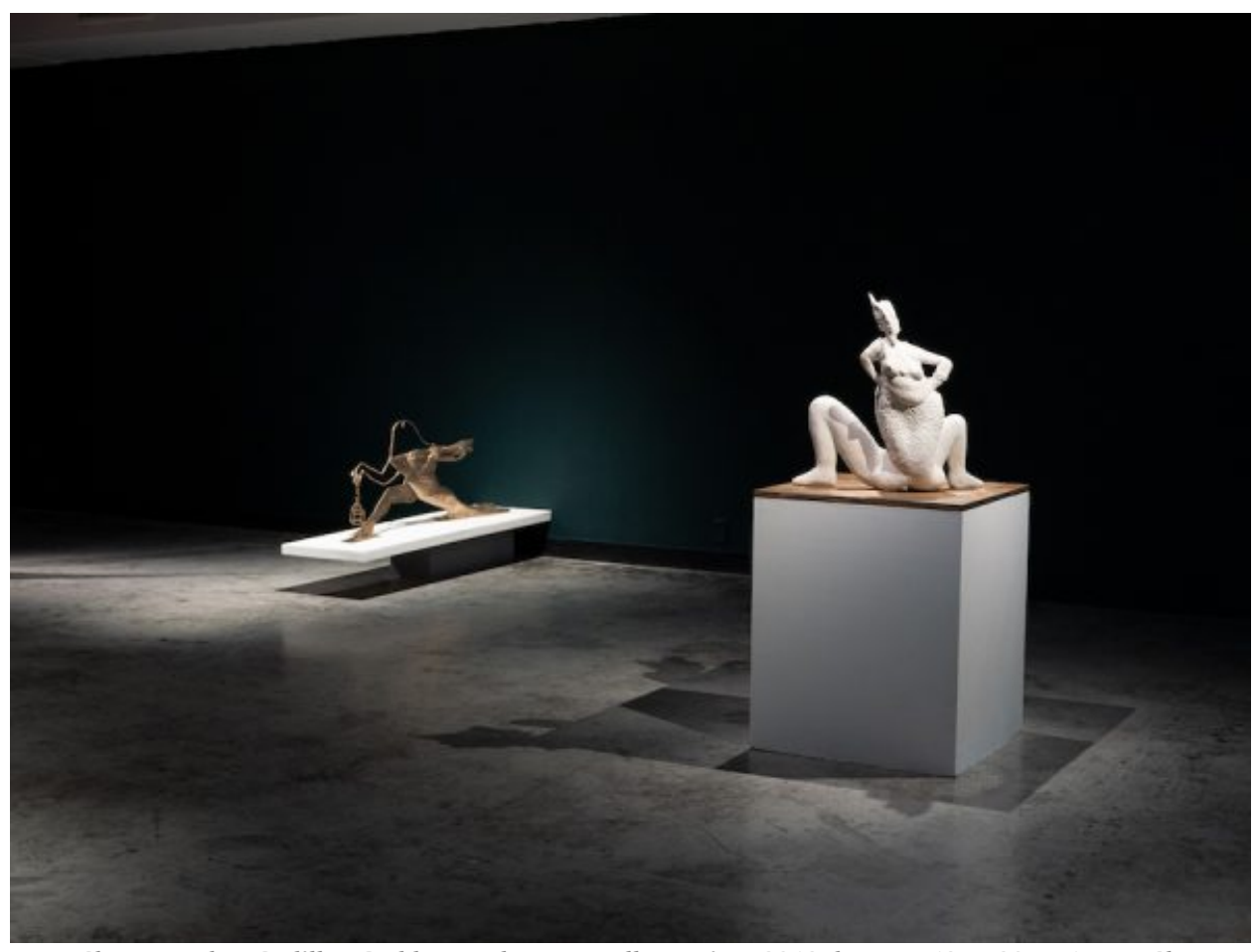
(L) Shana Hoehn, Cadillac Goddess and Paper Doll creeping, 2019, bronze, 48" x 20" x 4"; (R) Shana Hoehn, Obscene Songs [siren and Baubo], 2019, wood, putty, paint, 25" x 23" x 25"

The 14 sculptural works comprising Hauntings are primarily fabricated from metals, wood, clay, and plastics, but Hoehn has also incorporated digital manipulation technologies throughout. These contemporary shaping techniques are mostly latent, save for the impossibly refracted and warped behavior exhibited by some of the more traditional materials. The wood, putty, and paint in Obscene Songs [siren and Baubo] (2019) nod to Greek mythology and possibly blue humor. A deadly songstress — recalling Ursula from Disney's animated Little Mermaid , albeit with a vertically-pancaked skull — protrudes like a bawdy figurehead from the vulva-baring, notoriously ribald goddess Baubo. Exposed genitals are a trademark of Baubo statues, but the setup in Hoehn's piece hints at the importance of