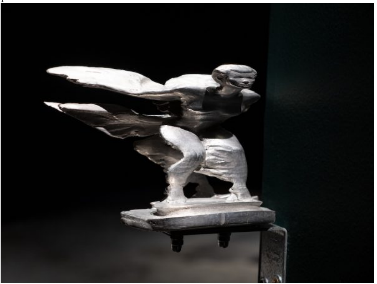
Shana Hoehn, Ghost of Spirit of Ecstasy, 2018, aluminum, 3" x 8.5" x 6"

timing; one must first get sucked in by the siren, then fully circle the compound-creature before the big reveal. Is the Goddess of Mirth delivering a punchline? A jab aimed at puritans, industrialists, or patriarchs?