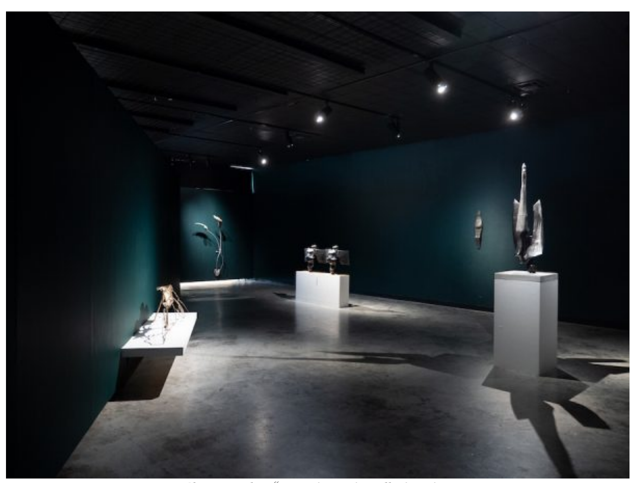
Shana Hoehn, "Hauntings," installation view

mass-produced machines with gleaming, brazen figurines of variously-exposed, wind-whipped women. These diminutive caricatures, Hoehn asserted in a recent interview with Mary K. Cantrell for Sightlines, reduced women to "trophies." By repurposing their forms into occasionally confrontational superbeings, Hoehn digs at the systems of capital and power that originally denigrated them. While the sculptures are gnarled and structurally outlandish, their subdued colors, murmuring under low lighting, produce an entangling veil. I eagerly returned multiple times to individual works, savoring the flummoxing process of trying to identify exactly just what the hell I was looking at.