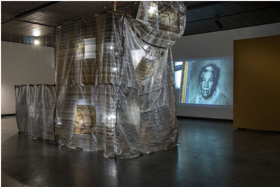
Installation view of "the meaning waivers" at Women & Their Work.

Ramirez's video "por amor" (2019) shows the artist crouching in a field of exceptionally green grass, vigorously scrubbing her hands—washing her hands of soil, with soil. A conversation in Spanish pipes through the attached headphones, with a single question in English lighting up the audio: She is a neighbor? An older female voice enthusiastically responds: Si, si! All the while, Ramirez continues to clean her hands in the video, seemingly detached from her dialogue in the audio.