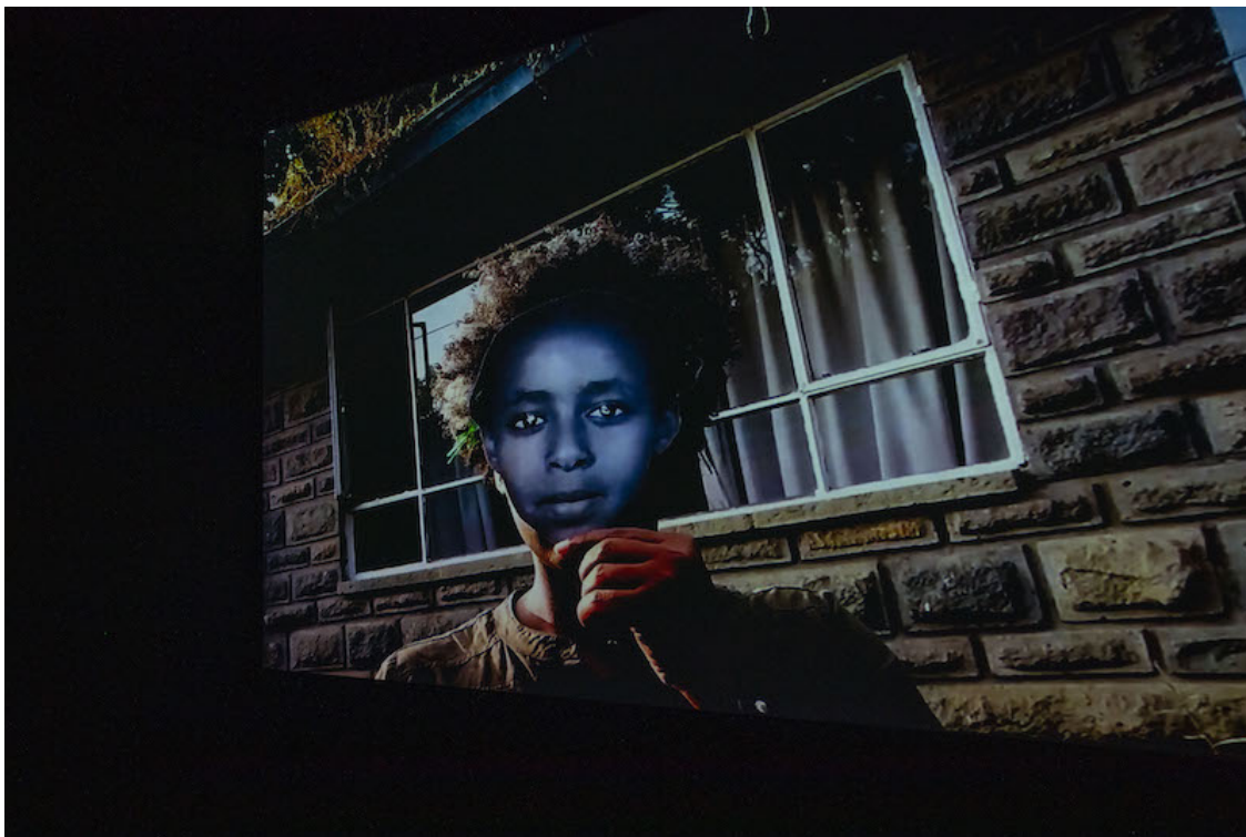
Still from Betelhem Makonnen's "change means revolution in Amharic (person, place and thing)," 2019. Two channel video with stereo sound, 5 minutes 36 seconds.

Through a series of phone calls which were "very vulnerable and very personal," the two women deepened that conversation — one, an immigrant, the other, a child of an immigrant, discussing experiences of displacement, disconnect, existing between two points. Near-identical revelations emerged despite their differences in age, culture, and background, which only reinforced the surprising ways in which they discovered they were already connected.