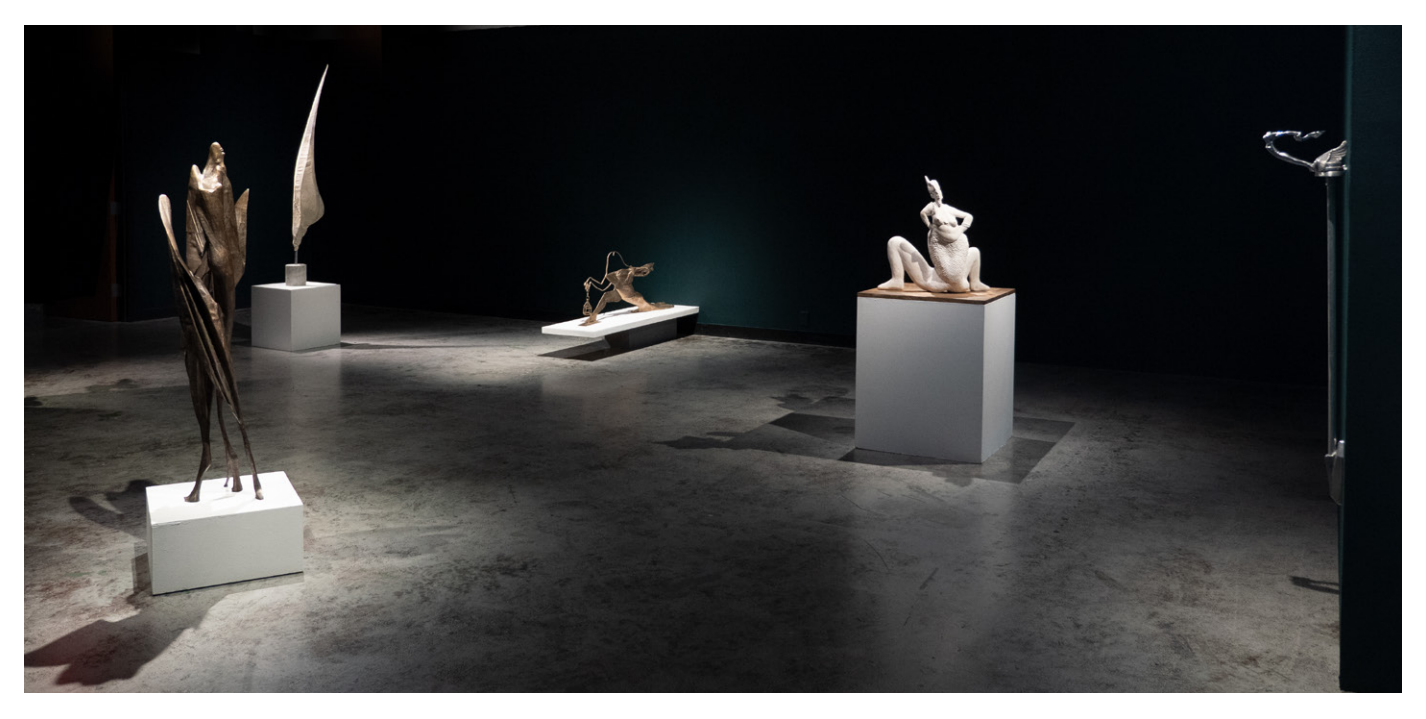
Hauntings, 2019, gallery view, bronze, steel, aluminum, ceramics, plastic, wood