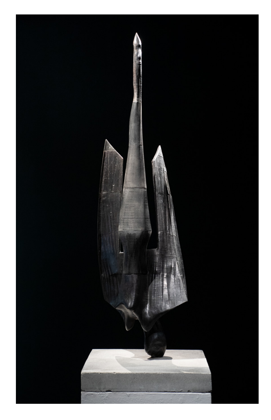
Above: Lady-jet and Giacometti, 2018, bronze, plastic, 45\ensuremath{\text{"}} \times 18\ensuremath{\text{"}} \times 18\ensuremath{\text{"}}

Cover Panel: Lady-jet defies speed and meets Venus (Sisters), 2018, plastic, ceramics, 49" \times 44" \times 10"