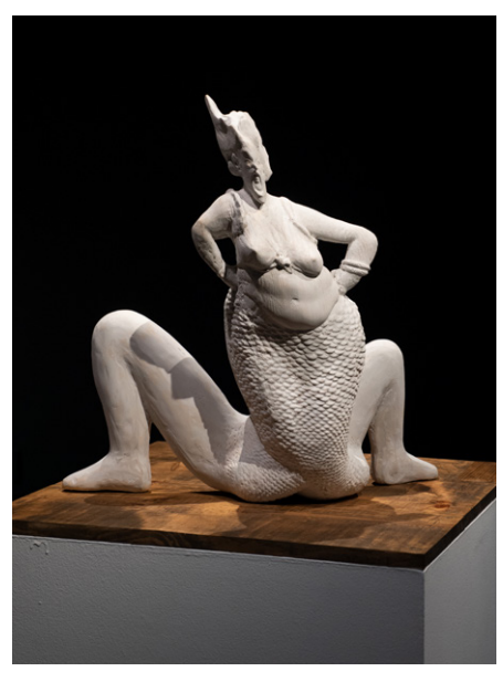
Obscene Songs (siren and Baubo), 2019, wood, putty, paint, 25" x 23" x 25"

Hoehn's practice is a strong consideration of the historically distorted female form as a symptom of ongoing socio-economic-political oppression. She contorts and manipulates contorted and manipulated female forms — reanimating these figures in such a way that they assume an agency for haunting. But Hoehn's historical concerns extend even further and, by building on this