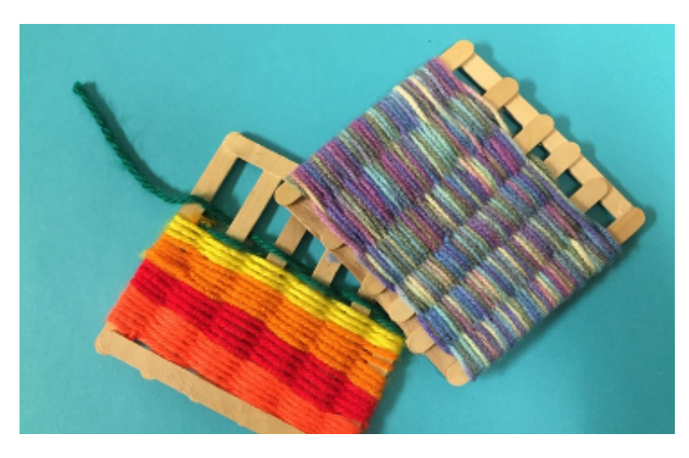
Finished Artwork Example