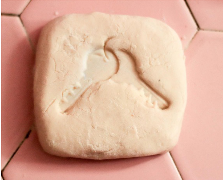
Finished Artwork Example