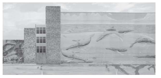
Detail of The Strip, Panel 6, archival pigment print, 2013.